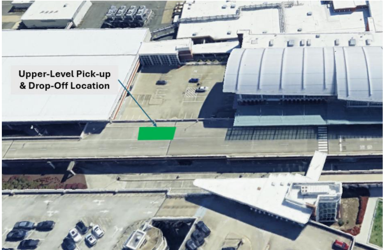
Upper-Level Drop-Off & Pick-Up Location