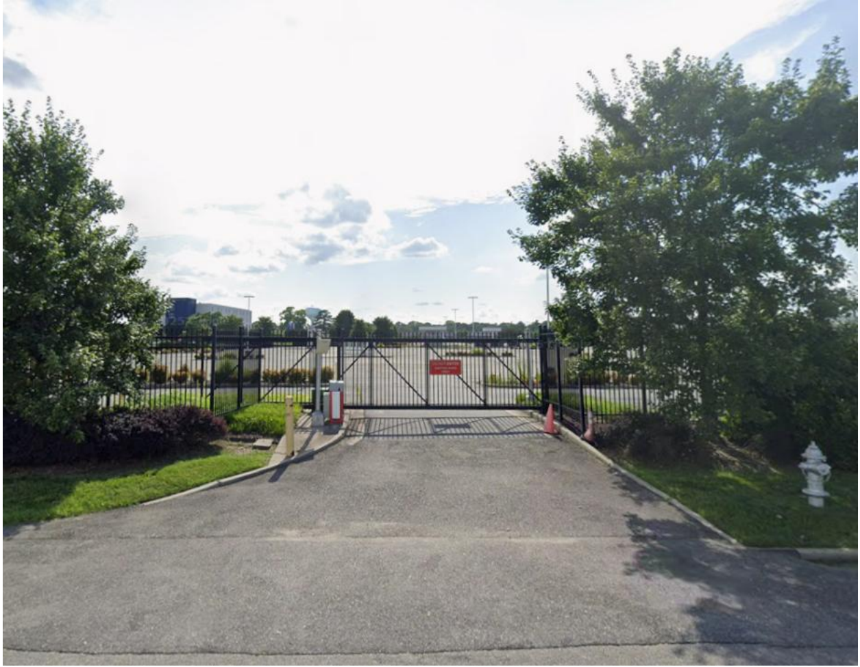
Economy Lot A Temporary Employee Lot Entrance & Exit Gate