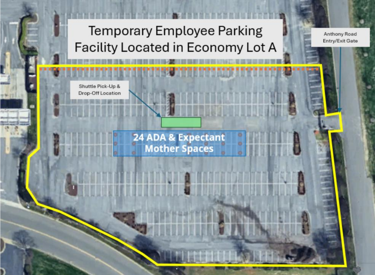
Economy Lot A Temporary Employee Lot Facility Diagram