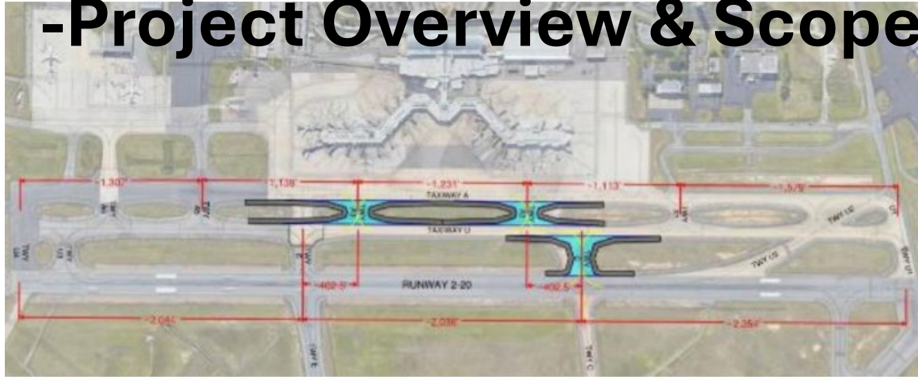
Figure 1-1: Project Location

The Taxiways C & E Intersection Relocation project scope includes the following components: