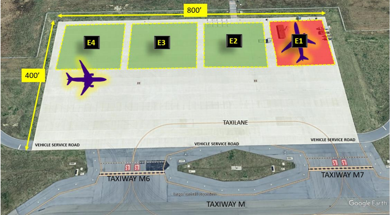
FIGURE 3b – EAST RAMP #3 (see Airport Diagram next page for location – contact Airport OPS for escort)

NOTE: There are no t-stops or markings other than spot E1. Nose in parking requires push back. Aircraft may oriented using alternative methods if taxiways, taxi lanes and service road remains clear. There is currently no ramp lighting other than a portable light tower.